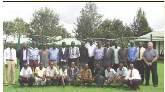
Current Kitale class