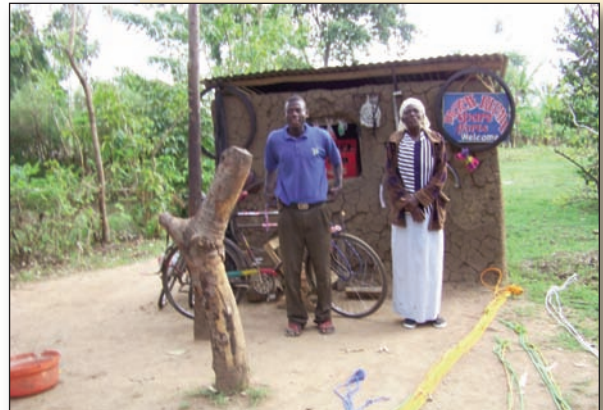
Bike repair whop