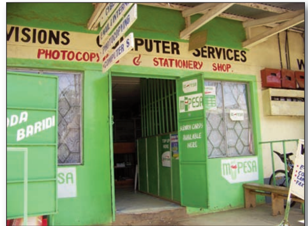
Outside typical M-Pesa shop

More than 90% of the 35 million people in Kenya do not have a bank account. (Banks are not trusted.) A mattress or a cookie jar becomes their bank. This cash system keeps the cycle of poverty in place because the families never build up capital (savings) or have money for an emergency. Robbery and theft remain rampant because the thieves know that their money is in their house. Safaricom (the major cell phone company) is one of the few companies that have the people's trust. With IBM's help they have set up a money transfer system using Safaricom phones. From this small start the money transfer division of Safaricom has