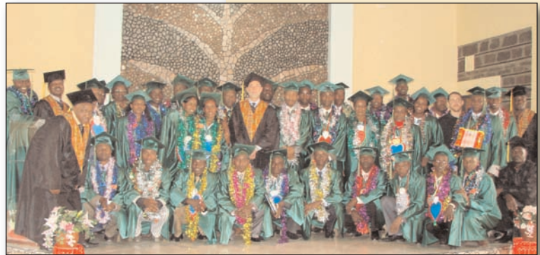
Graduating class of Nakuru