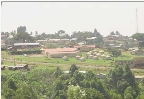
Bottom: Village of Kapchorwa

The picture at the right shows the KickStart soil block press being used. This machine will employ five to eight men while producing up to 800 quality cement/soil blocks a day. KMTI built its campus with this type of block. For less than $1,000 we can provide a job and poverty breaking income for eight men and their families. This one machine will provide money for food, education, medical care, personal items, and housing for an average of 50 people and their families. A one-time gift of only $20 per person will support them for many years. Compare this to supporting a child through World Vision for $360 per year for the next 10 years. It will take $3,600 to support just one child to maturity. With the same $3,600 gift three soil block presses will give 24 men the ability to support their children and live in dignity as small business owners. The soil press is just one example of several machines we will be providing with the micro loans. Manual cooking oil presses, irrigation pumps, well drilling equipment, and hay balers will be available through our micro loan program. You can see pictures of these job-creating machines at www.JobsforKenya.com