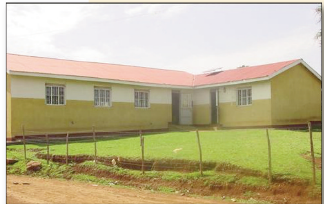
Kapchorwa Town Hall in Uganda